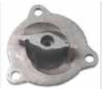
Stainless Steel Grinder Components