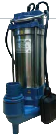
REEFE Submersible Pump (REG015)