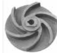
Cast Iron Impeller Components